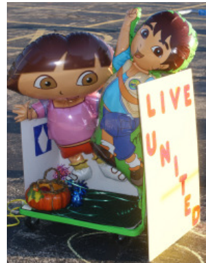
Delphi's Float entry for the 2008 Campaign Kickoff

US Federal Investigative Services US Internal Revenue Service US Postal Service US Social Security Administration Valley Area Agency on Aging VG's Food Centers Victor George Chrysler Plymouth Dodge Walgreen Drug Stores Wal-Mart Stores Westwood Heights Schools WEYI – TV 25 WNEM TV-5 Whiting Foundation William E. Walter, Inc. Xerox Corporation Yeo & Yeo, PC YWCA