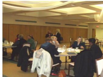
Volunteers participate in the FUNDO process.