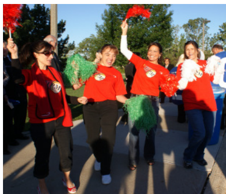
HealthPlus of Michigan cheerleaders "We got the Plus"