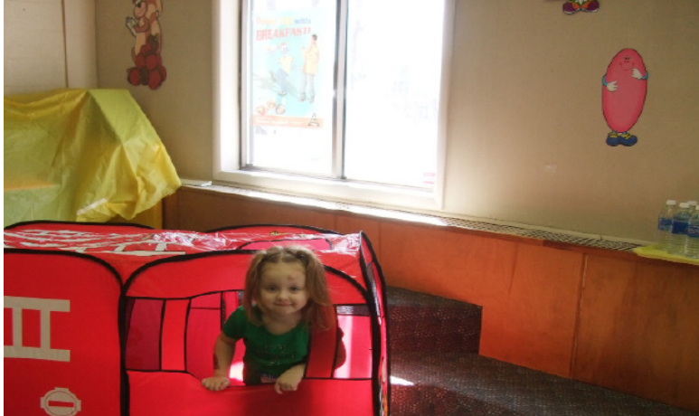
One of the many programs funded in part by the United Way - SKIP To A Great Start